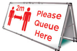
OUTDOOR PVC BANNER