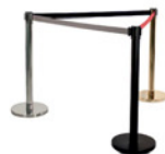
RETRACTABLE BARRIER SYSTEMS

Contact us on 01902 798 700 to discuss your COVID-19 safety requirements today, to help make a difference