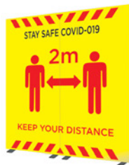
2000mm x 2000mm