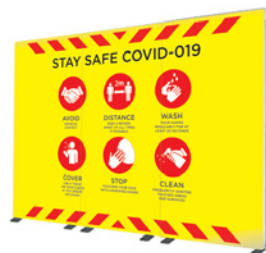
2000mm x 3000mm